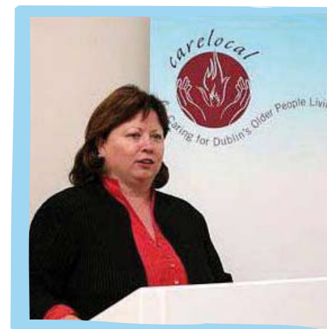
Mary Harney T.D. Minister for Health and Children speaking at the launch of the CARE Local Strategic Plan 2006-2008

The CARE Local Strategic Plan 2006 – 2008 was launched at the Carmichael Centre in June 28th 2006 by the then Táiniste and Minister for Health and Children, Ms Mary Harney T.D. Catering was kindly sponsored by Jaipur Restaurant, and the launch was well attended by representatives of the HSE, Dublin City Council (DCC) and voluntary groups, CARE Local volunteers and sponsors, and the press.