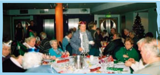
Christmas Day Party at The Park Inn Hotel, Smithfield